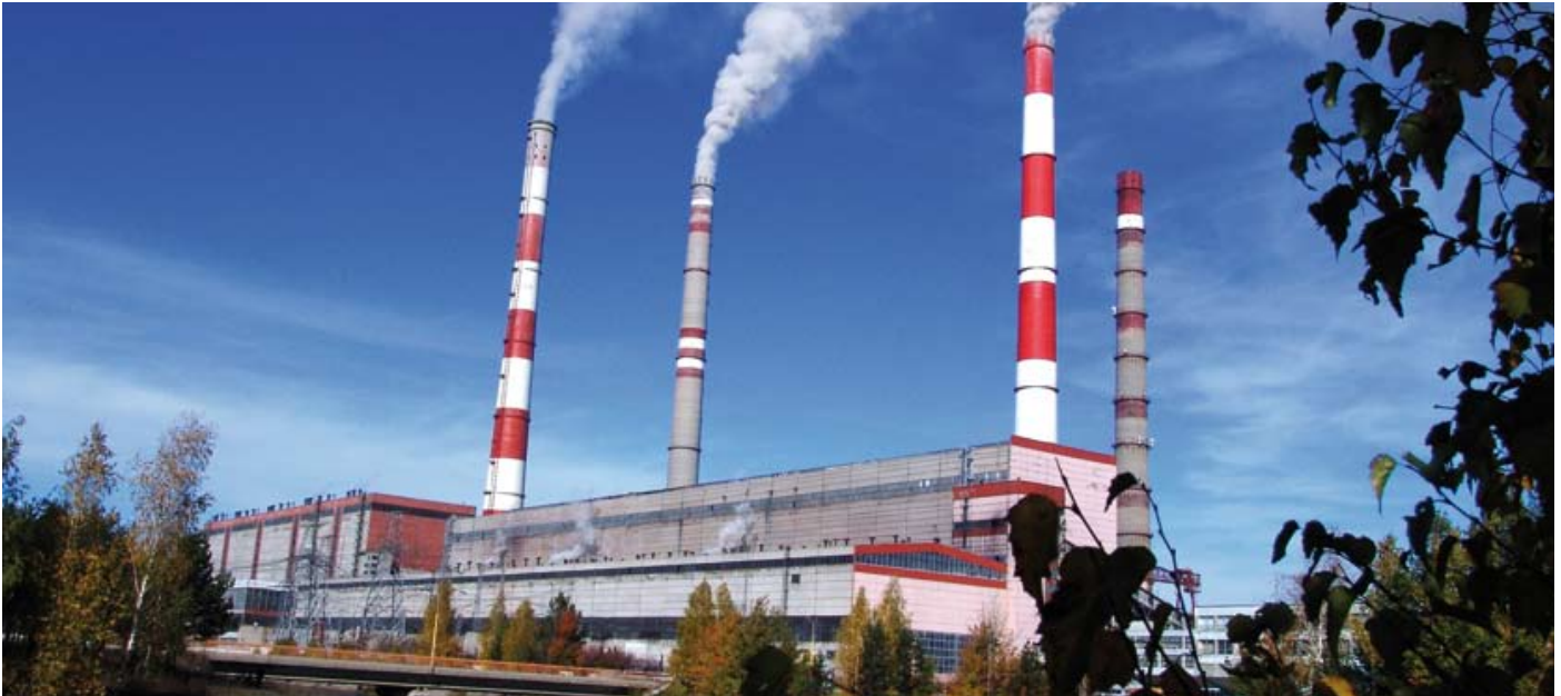
Reftinskaya GRES power plant

A contract to deliver fly ash handling equipment on all ten bituminous coal-fired units of Reftinskaya GRES, located in the Urals, has been awarded to Clyde Bergemann Doncaster (CBD), the Power Group's materials handling centre of competence in the UK.