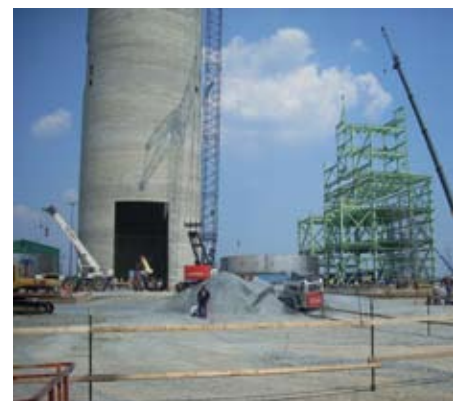
Construction has begun at Mirant's facility located in Morgantown, Maryland in the US

The lime will be metered out of a weigh hopper and pneumatically conveyed to injection points in the flue gas duct between the line booster fan and FGD absorber. A total of four separate systems is required to meet the injection requirements at all locations. The system delivery and installation takes place in three increments from May through September 2009.