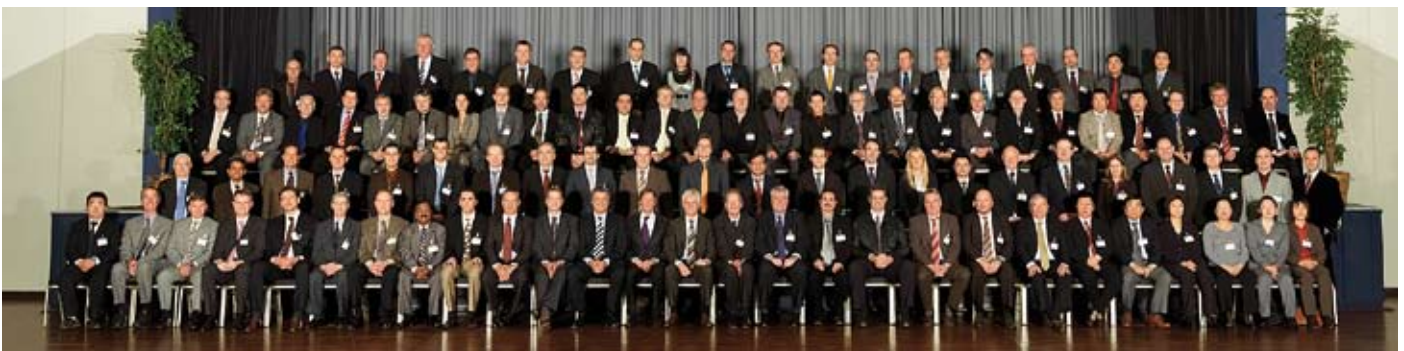
Participants of the Clyde Bergemann Power Group sales conference

Every year in November, Clyde Bergemann Power Group hosts a sales conference in Wesel, Germany where more than 100 key personnel of the Group's research and development and sales departments congregate to share knowledge and experience of product and market developments for new solutions.