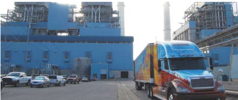
Clyde Bergemann Americas technology trailer at the Fayette power plant

Clyde Bergemann Delta Ducon was awarded the contract to design, manufacture and deliver the modification of the fly ash system at the Lower Colorado River Authority's Fayette Power Project.