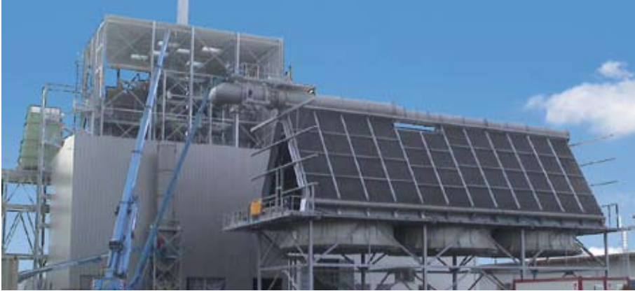
The Heiligenkreuz Biomass Plant, Austria is installed with Clyde Bergemann TERMOTEC air condensers

The Clyde Bergemann Power Group has acquired the company "TERMOTEC Gesellschaft für Energie und Umwelttechnik GmbH", located in Wilnsdorf, Germany. This step increases the capabilities and capacities to market the new business unit for heat exchanging and energy recovery solutions, which has been established with the take over of Australian based company Senior Thermal in December 2006.