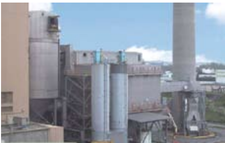
Project example of Clyde Bergemann EEC: Installation of spray dry absorber and reverse air fabric filter technology at a New York waste-to-energy facility

Existing mercury regulations in many US-states are driving the demand for activated carbon for mercury control at a rapid pace. It is expected that demand will exceed domestic supply capacity in 2010 and beyond.