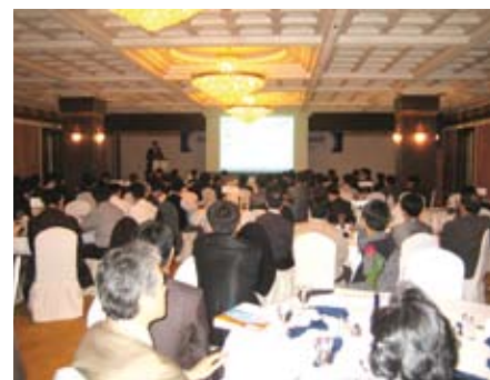
Clyde Bergemann Power Group, alongside our local sales agent hosted a successful technology seminar in 2008

The forecast for power consumption sees a yearly growth of 2.1% by 2022. To meet demand, the government plans a capacity expansion of some 32 MW by building 12 nuclear plants, 11 gas-fired and 7 coal-fired stations.